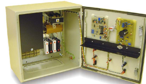
Battery pack 2No. P4293